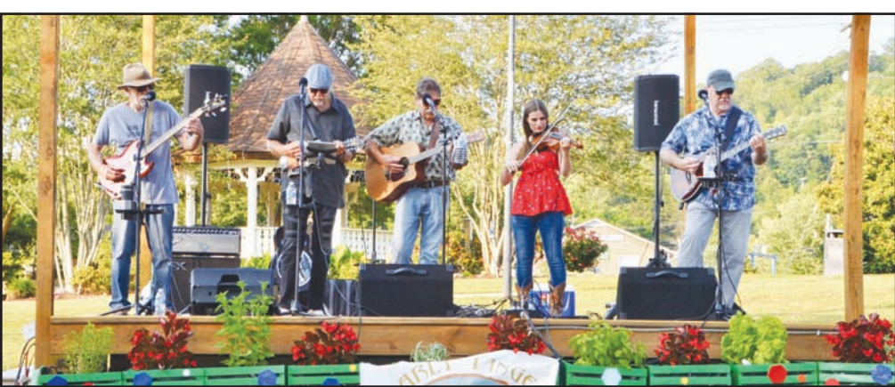
Gnarly Fingers performed in Hiawassee on June 1 as part of the "Enchanted Music on the Square" concert series.