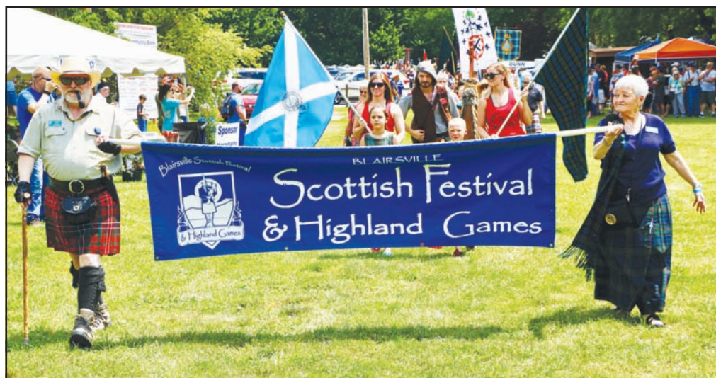
The 2019 Blairsville Scottish Festival & Highland Games will take place this weekend on Saturday, June 8, and Sunday, June 9, at Meeks Park.