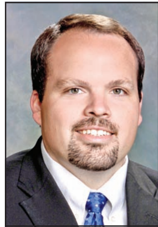
Jeremy Nelms be revenue neutral for average power users, meaning the EMC will lower the variable energy charge (kWh) and increase the