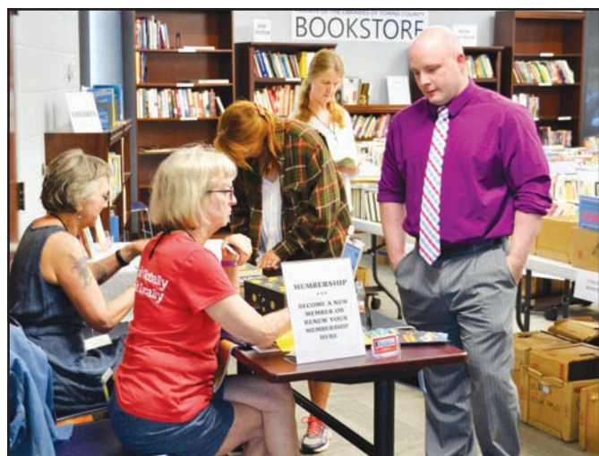
Members of the public supporting the local libraries by shopping at the Friends of the Libraries of Towns County's annual Book & Bake Sale on May 31.

And each year, the Friends make sure to qualify for the Towns County Commissioner's Matching Challenge Grant, which doubles the amount of